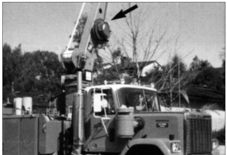
GLEASON K-REEL installed on a hoist.